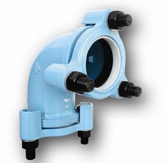
Plain End to Plain End