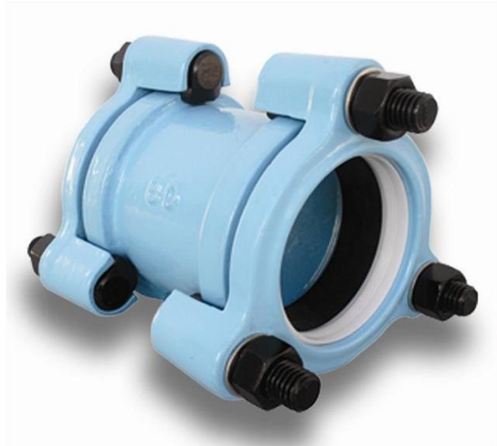
Plain End to Plain End